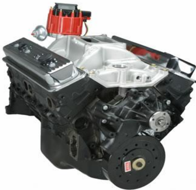
Corrected Performance Graph