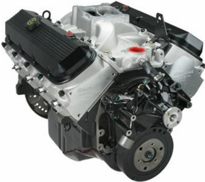
Corrected Performance Graph